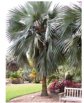
A correctly pruned palm

When removing a dead or diseased frond, make the cut close to the base of the petiole. Cut from the underside of the frond to avoid breaking the petiole or damaging the trunk.