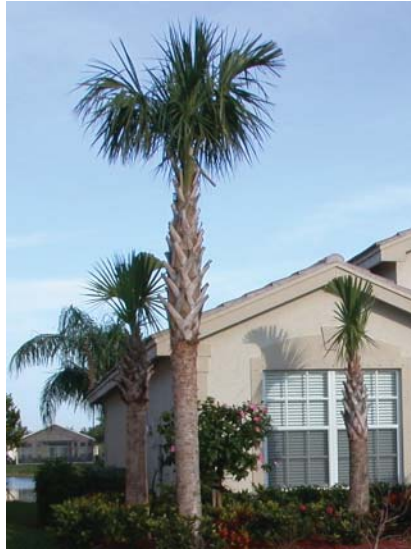
Two of these palms are planted too closely to the house. This problem may lead to over-pruning.

Know how tall your palm will grow. Too often palms are planted too close to buildings. When palm fronds rub against a building they provide a bridge for roof rats, ants, and other creatures that may cause damage to a structure or be a nuisance. Also, green fronds may be unnecessarily pruned, creating a number of problems, as we'll see later.