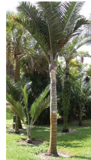
Too many green fronds have been removed from this palm.

Brown or dead fronds can be removed throughout the season, as well as flowers, seeds, or coconuts. Remove green fronds only when they are obstructing a view or rubbing against a building or structure.